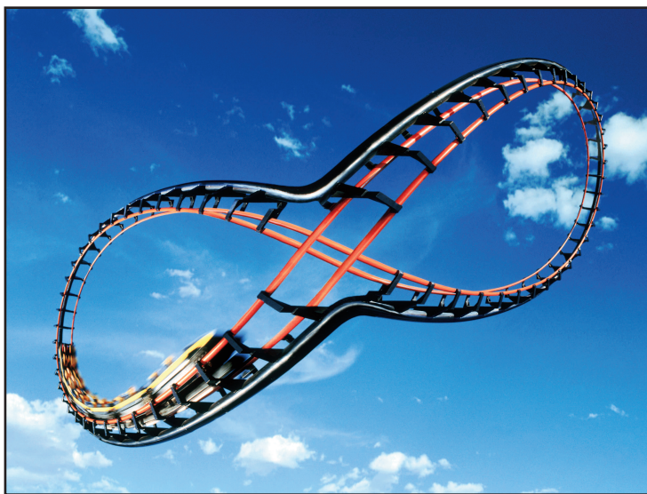
A prototype of one of the rides

“We were going to build a vertical drop ride, but we’ve got