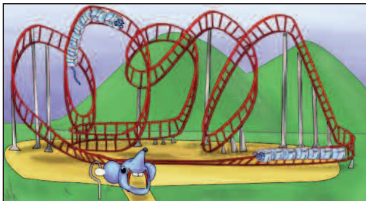
A design for one of the new attractions

permission to use the cable car on the Isabela de Torres mountain which we’ll tie in with the Moto Ride. We’ll add in some wind machines, some waterfalls and increase the cable car drop speed. Should be quite a ride!”