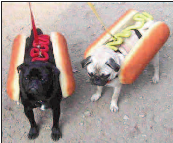
Hotdogs - two for 100 pesos

area. Allegedly, Disney has already purchased several large tracts of land using various holding corporations around the Long Beach and Costa Dorada area of Puerto Plata.