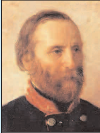
Garibaldi - shop-keeper, film star, Italian patriot & biscuit.

Then, a friend watching the popular movie "Natale in Crociera" (Christmas on a Cruise) saw Garibaldi and his mistress in the background of a scene.